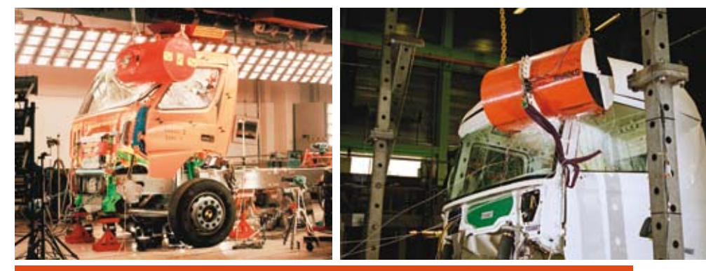
Above: A-pillar crash testing ensures safe and strong cabin design

"Each year there are approximately 5,000 fatal crashes involving large trucks, more than 100,000 injury crashes, and about 350,000 property damage-only crashes"